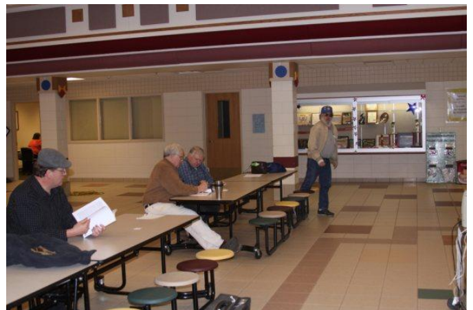
Mickey I see you!